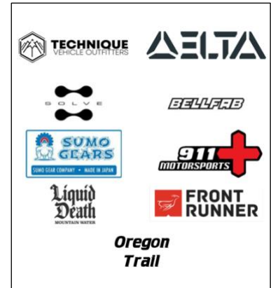
2023 EVENT SPONSORS