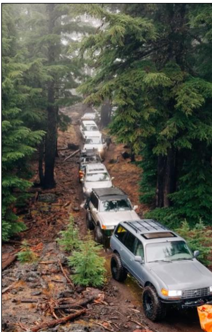
2023 EVENT PARTICIPANTS

We are an active chapter of the Toyota Landcruiser Association. Founded in 1976, TLCA has grown from a handful of people to a vibrant organization of more than 4,000 members world-wide who champion the history and tradition of the Land Cruiser and other Toyota 4WD vehicles. The TLCA is family-oriented, promotes responsible off-highway travel, and advocates environmentally conscious multiple use of public lands.