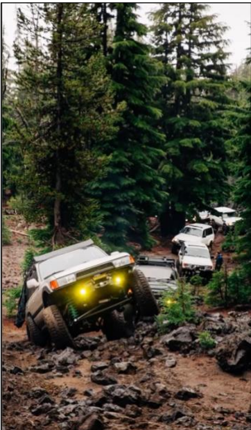
2023 EVENT PARTICIPANTS